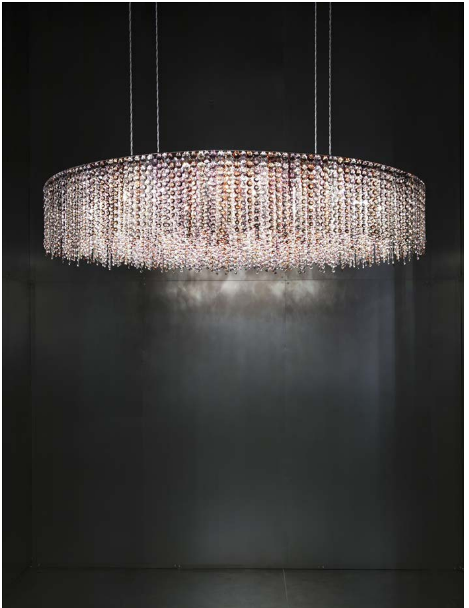
in the picture V-rondò 160

Via Fratelli Vivarini 7, I-20141 Milano, Italy tel +39 02 895 023 42 fax +39 02 895 409 74 info@lollimemmoli.it www.lollimemmoli.it