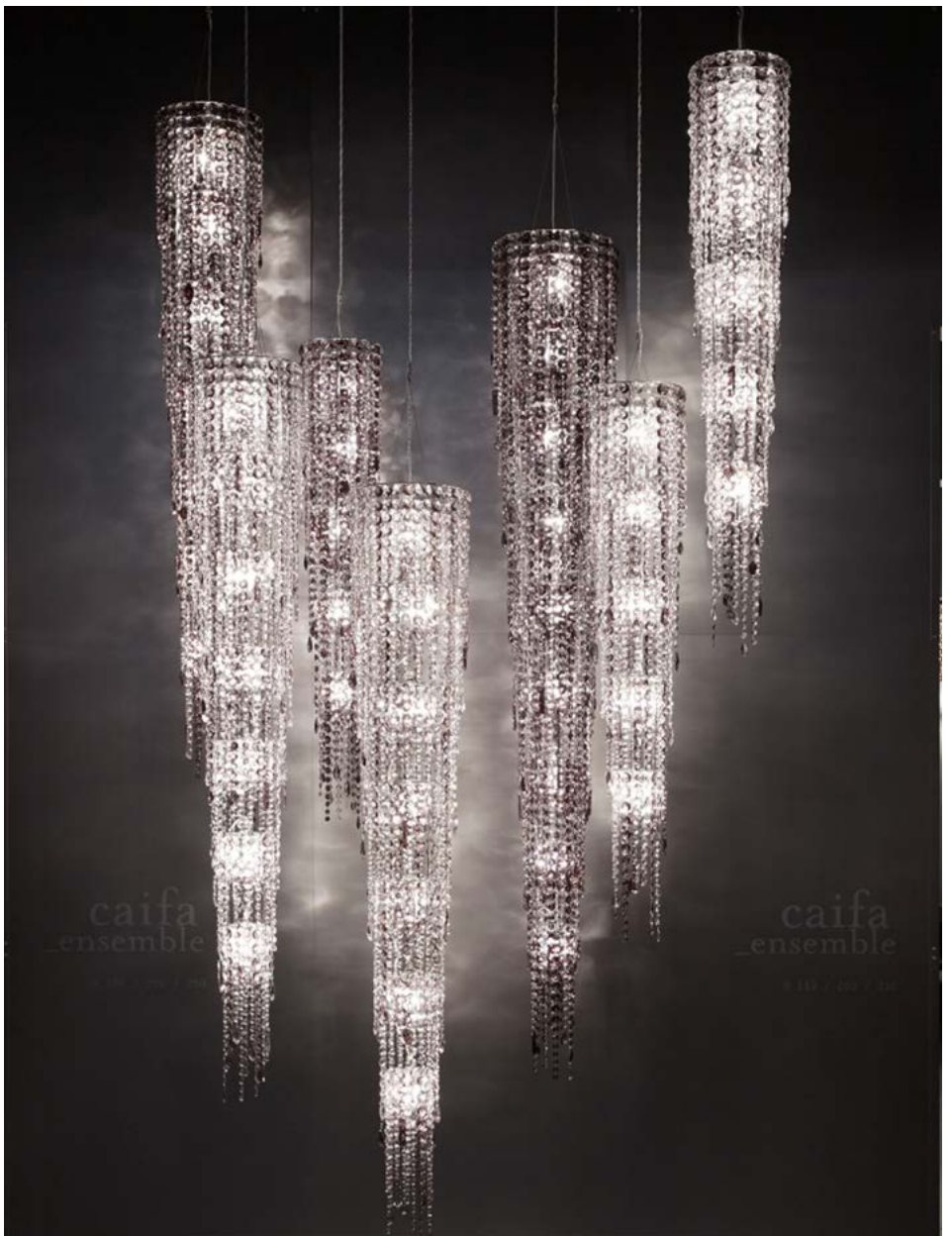
in the picture Caifa circular

Via Fratelli Vivarini 7, I-20141 Milano, Italy tel +39 02 895 023 42 fax +39 02 895 409 74 info@lollimemmoli.it www.lollimemmoli.it