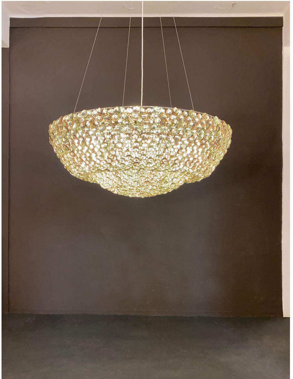
in the picture U2 100

Via Fratelli Vivarini 7, I-20141 Milano, Italy tel +39 02 895 023 42 fax +39 02 895 409 74 info@lollimemmoli.it www.lollimemmoli.it