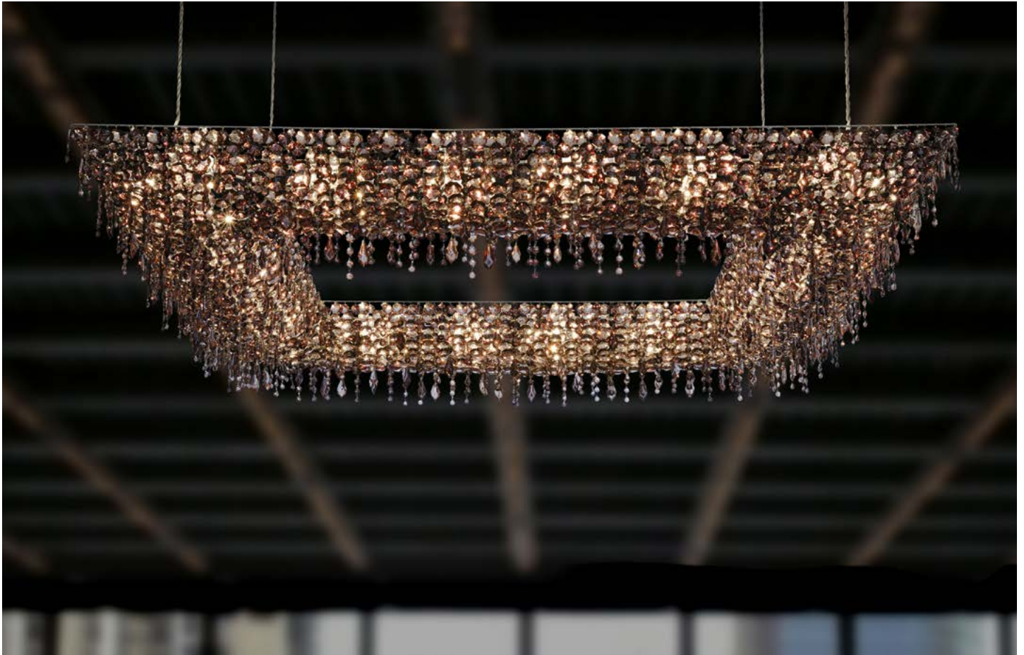
in the picture Ugolino system rectangular 150x180