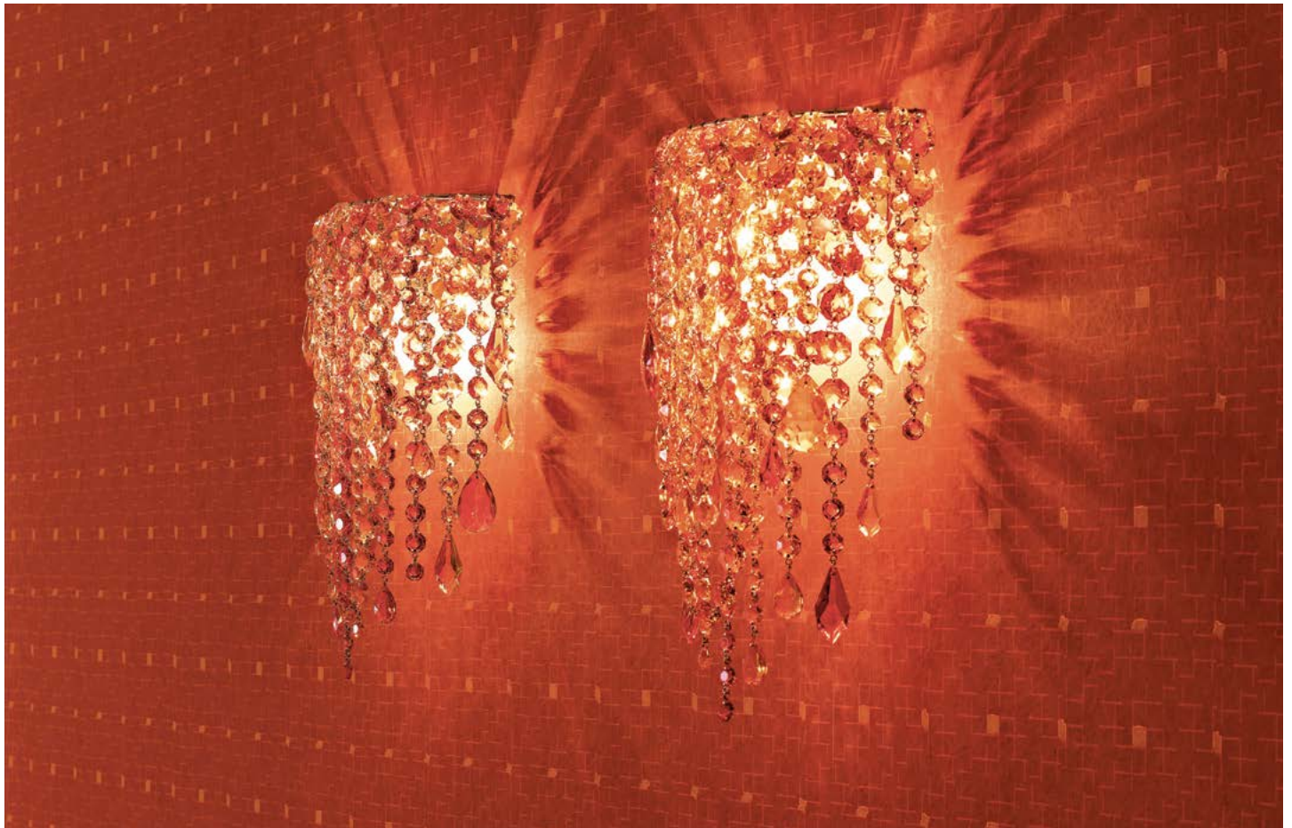
in the picture Vladinia circular 22