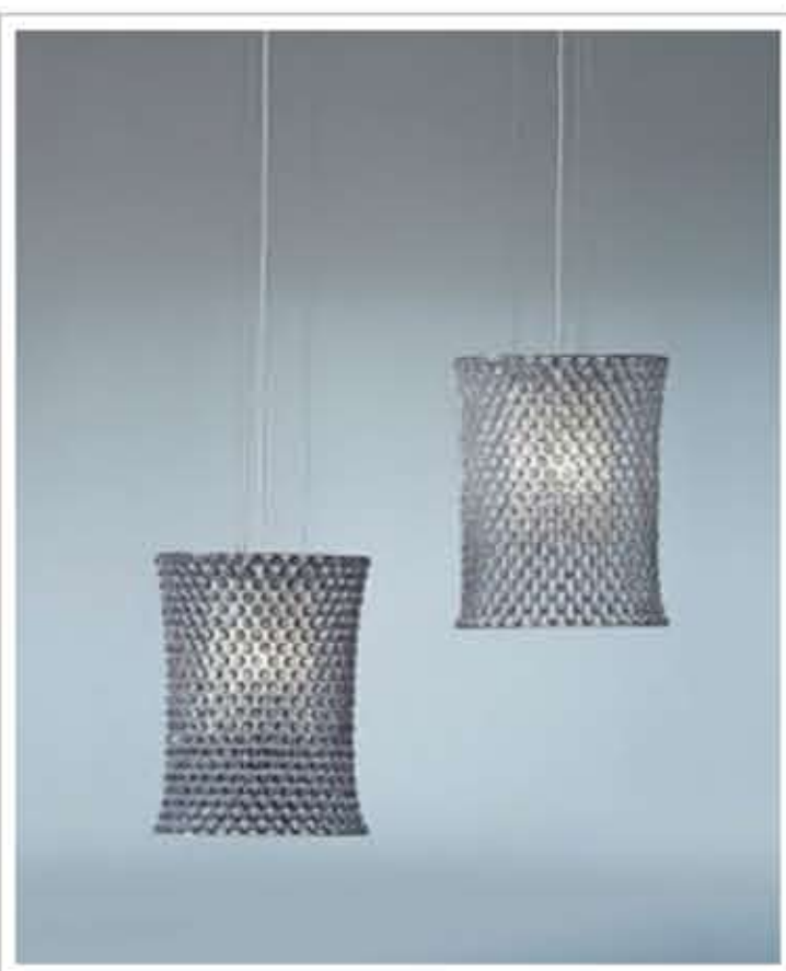
Above: Aires 80 - 60 (left) & Aires 36 (right)

Lolli e Memmoli is another brand which we have in both our New Zealand and Australian stores.