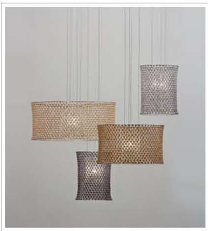
Above: Aires group