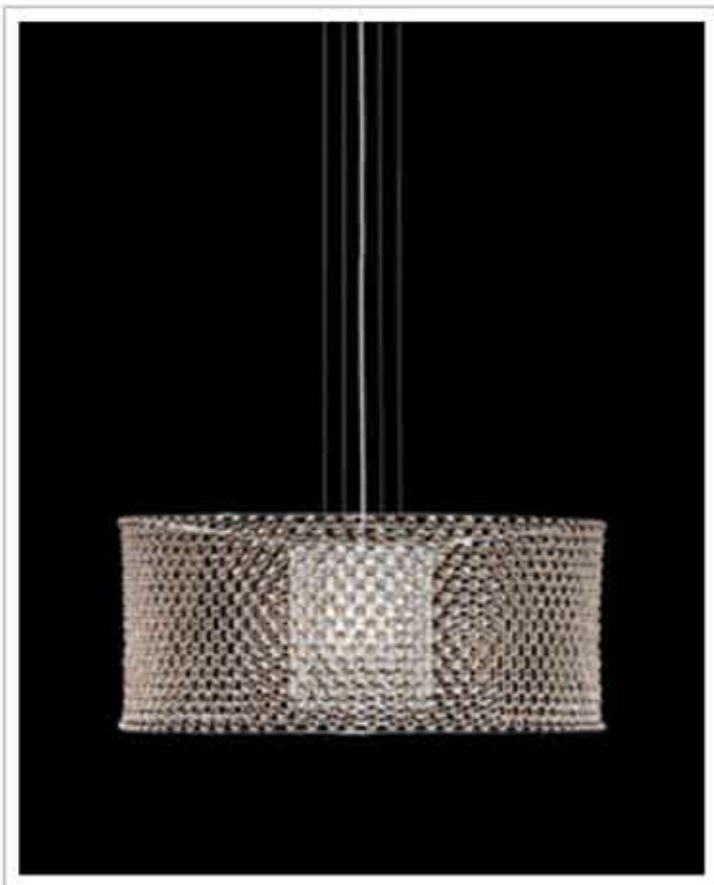
Above: Aires 80