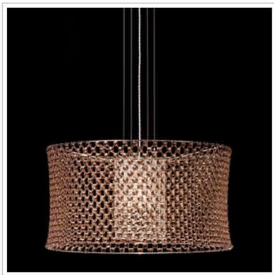
Above: Aires 60