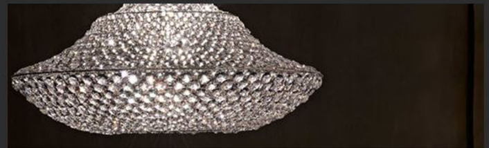
LOLLI MEMMOLI: VIET