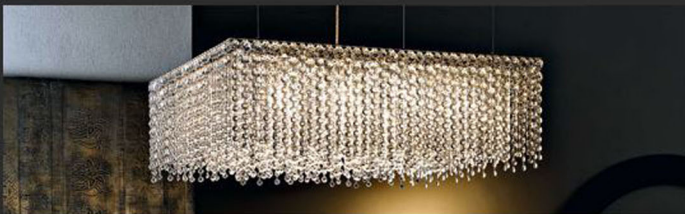
LOLLI MEMMOLI: V-CARRE