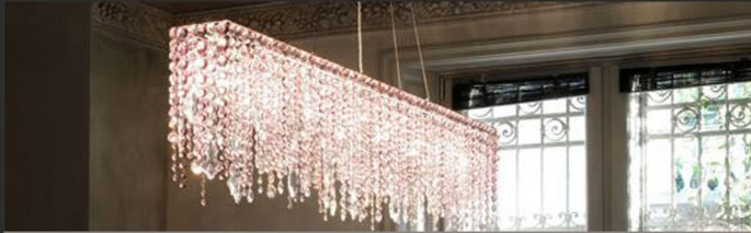
LOLLI MEMMOLI: ARIEL