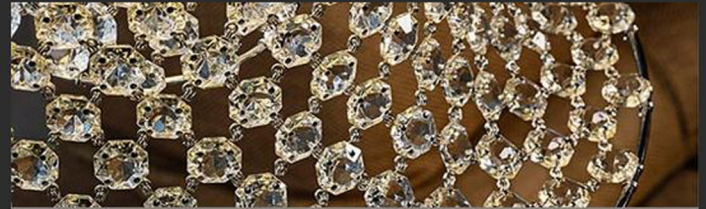
NEW · LOLLI MEMMOLI: TAUT