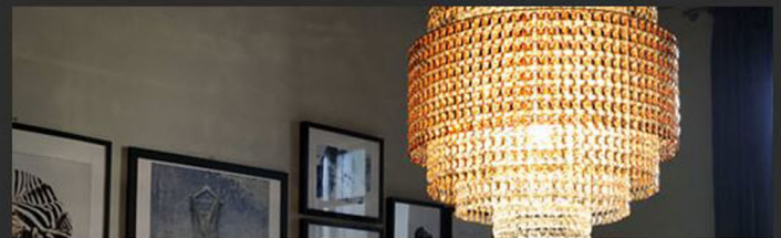
LOLLI MEMMOLI: PHEBO